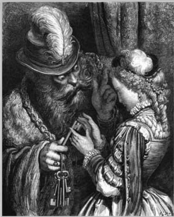
(by Gustave Doré)

There is no other visible entrance to the castle than the front one. I was considering entering through the arrow slits on the first floor or one of the windows on the second floor when I saw a man coming from town to the castle. I cast fly to make sure I didn't make any noise and followed him inside. The gaunt manservant was an older man, and looked disdainful of everything. I was lucky, this was Conomor going back to the castle.